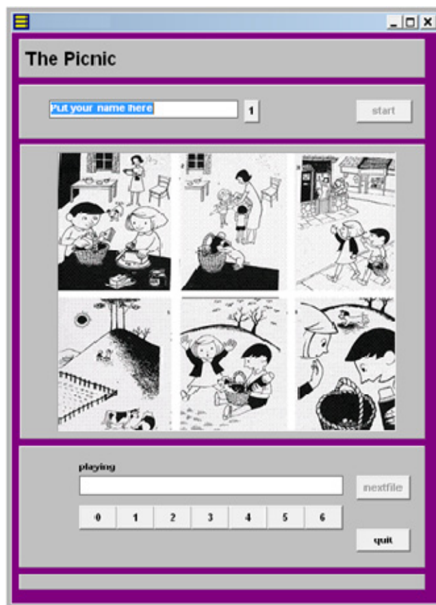
Figure 1. The interface of the computer program in this experiment

The raters assessed the oral texts using a program especially written for the experiment (Note 1). The six pictures in the story-telling task were incorporated into the interface of the program (see Figure 1). Raters listened to the five texts using headphones and marked each segment in turn. Segments in each text were automatically activated after an eight-second pause. During the pause, raters were asked to provide a mark on range of vocabulary for the segment that they had just heard. After the first text had finished, they were required to provide a mark on vocabulary for the whole text. Then, after pressing the button 'nextfile', raters proceeded to the next text. Two sets of vocabulary scores were thus retrieved from raters: segmental scores for every segment within each of the texts and an overall vocabulary score for every text.