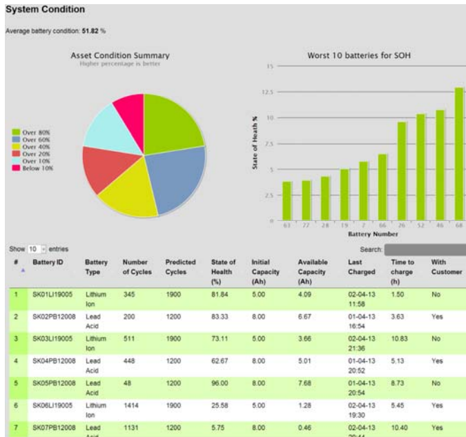
Fig. 3 - Example of System Information Displays

A web application has been developed that can show the information in the database in a user-friendly manner (data presented depends on viewer, with different levels of information available to system users, operators, maintenance technicians and designers), using charts and tables where appropriate (Fig. 3.).