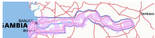
Fig. 2 - GSM coverage in The Gambia. Purple areas show GSM availability

For community charging station solutions, as the operator becomes more technically astute in the operation of a PV charging station, more control can be devolved to them.