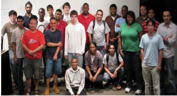
Figure 1. The Fall 2010 eStadium VIP team. They design, develop, and deploy systems that enable studies of wireless network traffic during football games. Fans in the stands go to: http://estadium.gatech.edu/iphone to access stats and on-demand video clips of plays for GT football games. Students from CEE, ECE, CS, and ISyE participate in the team. They also design social network apps and wireless sensor networks.

that the project can evolve based on contributions from everyone on the project, including the undergraduates.