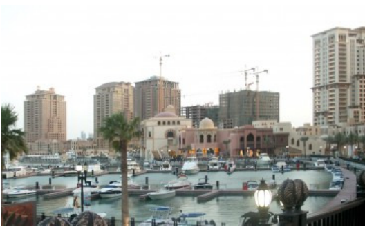
THE PEARL DEVELOPMENT: A NEW LIFESTYLE FOR AN EXCLUSIVE SEGMENT OF SOCIETY