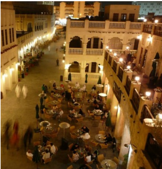
SOUQ WAQIF AT NIGHT, A SUSTAINED VIBRANT URBAN SPACE