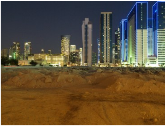
DOHA, DESERT AND CITY