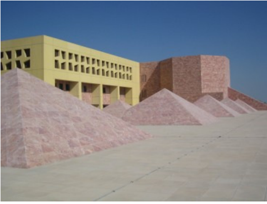
LEGORETTA'S TEXAS A & M ENGINEERING COLLEGE AT THE EDUCATION CITY