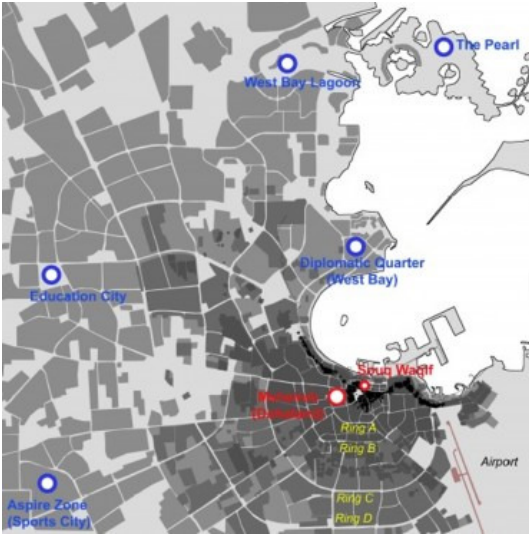
DOHA NOW: THE REACTION AND RESULT OF THE GLOBAL CONDITION