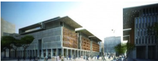
AL-BARAHAT SQUARE BY MOSSESIAN & PARTNERS (SOURCE: ©MOSSSIAN & PARTNERS)