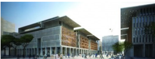
AL-BARAHAT SQUARE BY MOSSISSIAN & PARTNERS