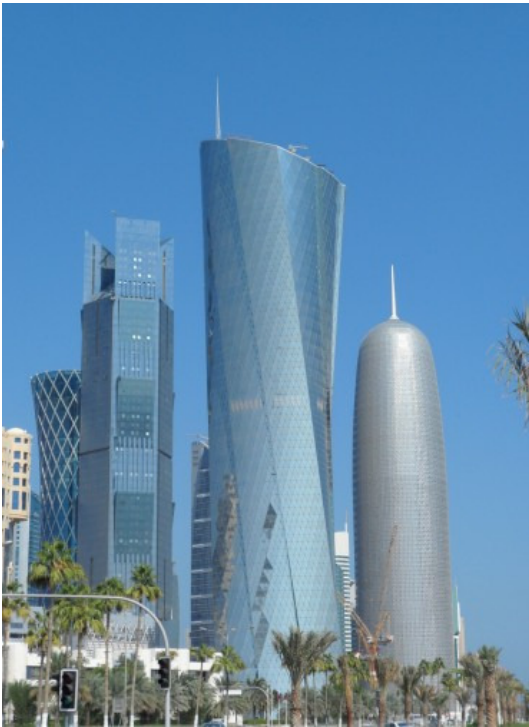
MULTIPLE PERFORMERS COMPETE IN CREATING A UNIQUE URBAN IMAGE