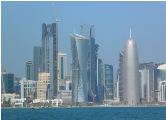
DOHA'S WEST BAY BUSINESS DISTRICT