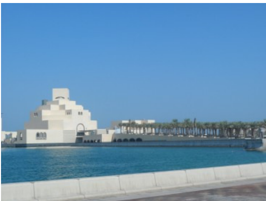
I.M. PEI'S MUSEUM OF ISLAMIC ART

nation of different societies, from the Atlantic ocean to the Arabian sea, bound together by common linguistic, cultural, religious, and a shared historical heritage. There is also an indirect influence of 'Islamism,' that offers an ideology which largely displaced 'Pan-Arabism.' Across the Gulf, the influence of 'Islamism' may also be seen as coming from Contemporary Persia as it used to flow in the past.