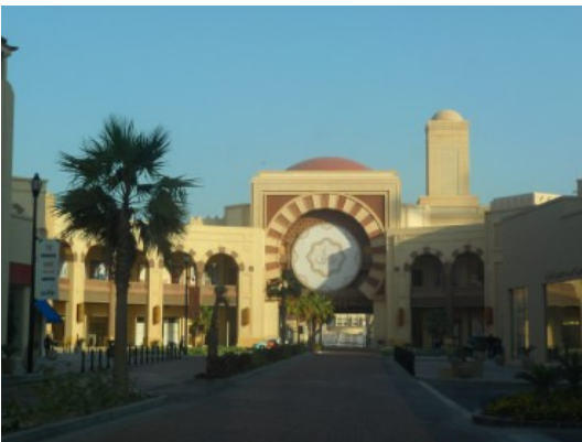
THE PEARL DEVELOPMENT: ECLECTIC MEDITERRANEAN AND EUROPEAN STYLE UTILIZED FOR IMAGE MAKING

developed from traditional Arabic mosaics that are evocative of the crystalline structure of sand. This was based on intensive studies to abstract the essential characteristics of the context while introducing new interpretations of geometric patterns derived from widely applied traditional motives.