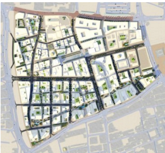
MSHEIREB URBAN REGENERATION MASTER PLAN BY A CONSORTIUM OF AECOM, ALLIES AND MORRISON ARCHITECTS, AND ARUP