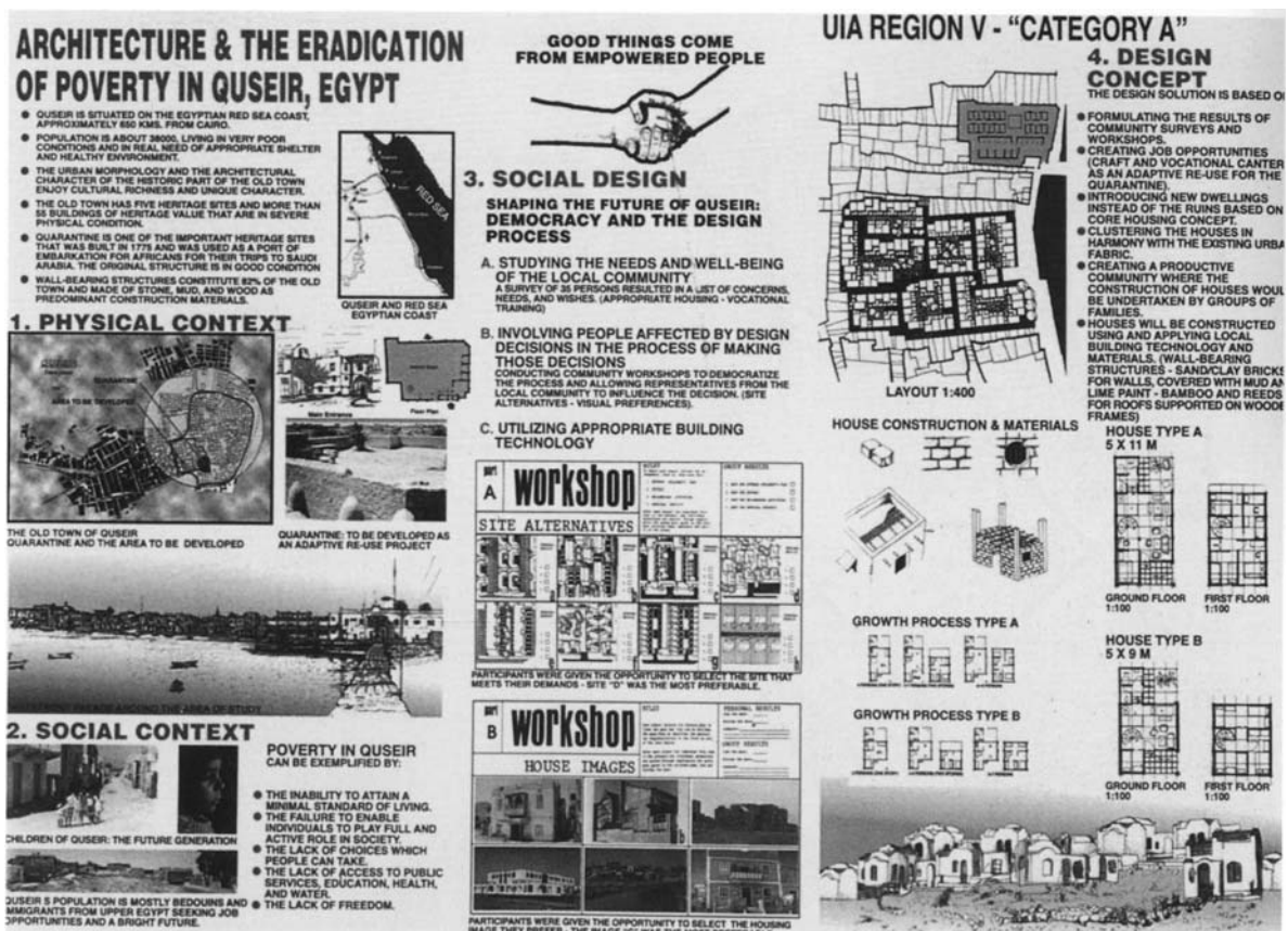
Figure (3). The winning project (Architecture and the Eradication of Poverty in Quseir) illustrates a community design approach in housing and development processes.