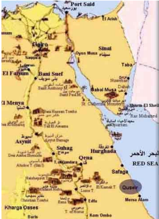
Figure (1). The location of Quseir on the Red Sea coast – its relation to other major cities.

the individual facades have retained the best of its traditional appearance, scale and proportions, and visual quality. They are traditional in terms of reflecting the cultural aspects of the region, where similarities are evident in the visual attributes of buildings, both in Quseir and other cities at the Western Coast of Saudi Arabia, especially Jeddah. Streetscape elements together with architectural features form an intrinsic part of the urban fabric including shrines and vistas (Salama, 1996).