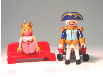
Figure 1: Example photos