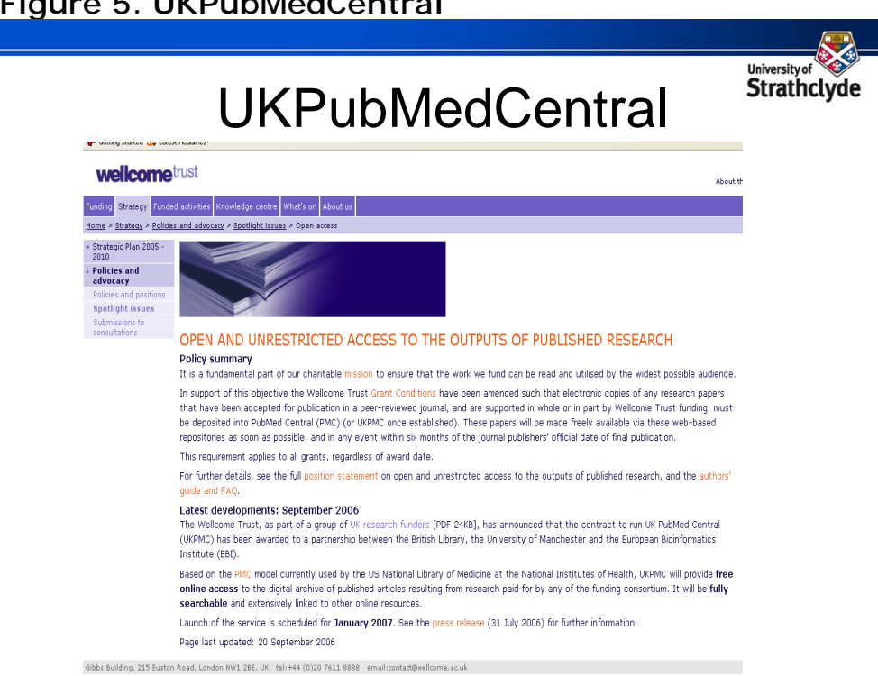
Figure 5. UKPubMedCentral

Launched in January 2007, the initial phase of developing UKPMC involves mirroring the PMC database, and implementing a manuscript submission system to enable UK scientists to submit their research papers for inclusion in UKPMC. The project is supported by the eight major UK biomedical funding agencies who between them fund over 90% of research in biomedicine in the UK. The fact that they have mandated deposit will not only lead to a much higher rate of deposit but should give UK scientists an edge in terms of citation.