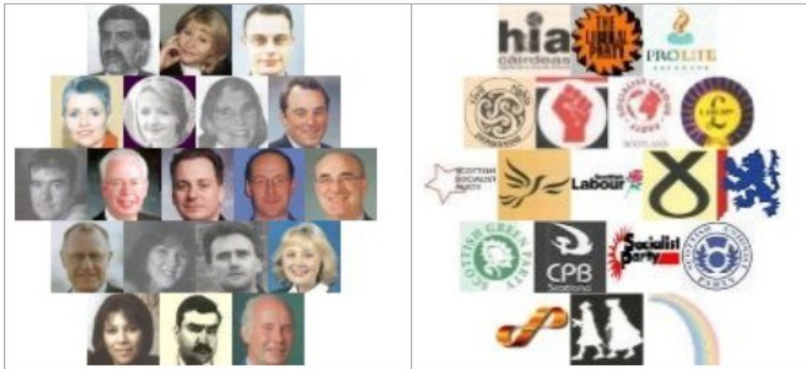
Candidates from Aspect (left) and Party Logos from Aspect (right)

Aspect is digitising political pamphlets from the first Scottish parliament elections in 300 years.