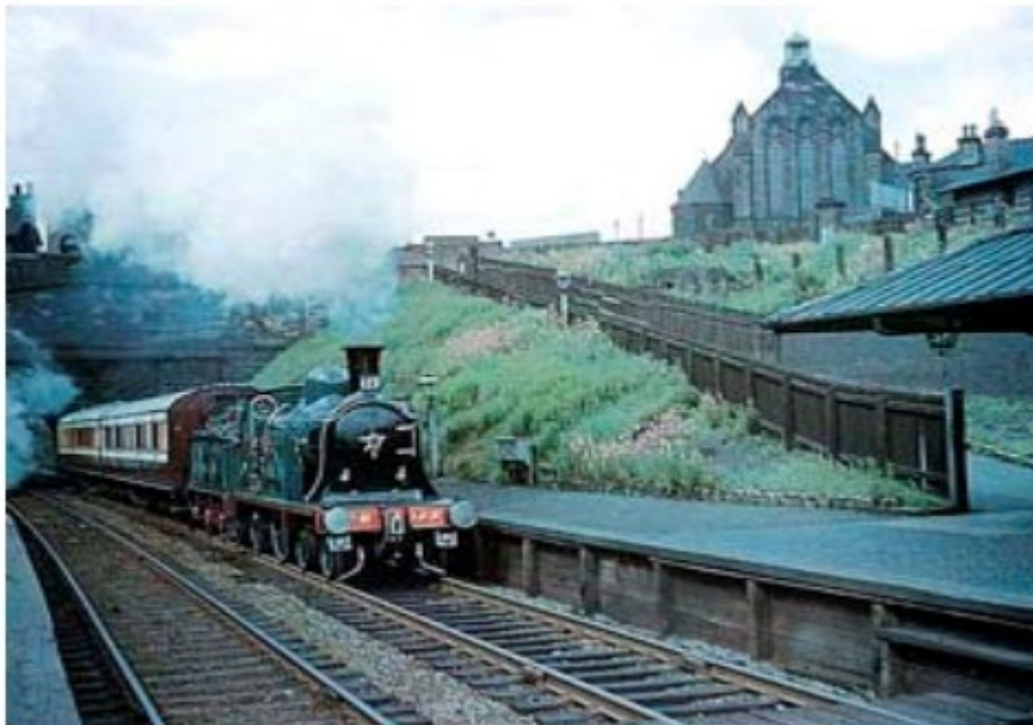
Caledonian Railway engine no.123, built 1886, from Springburn Community Museum

Aspect is digitising political pamphlets from the first Scottish parliament elections in 300 years.