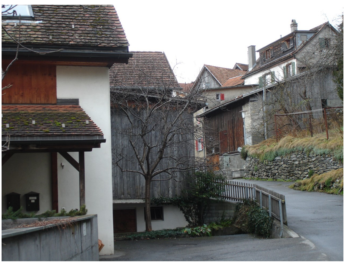
Figure 1 Haldenstein character unified by stone and timber barns.