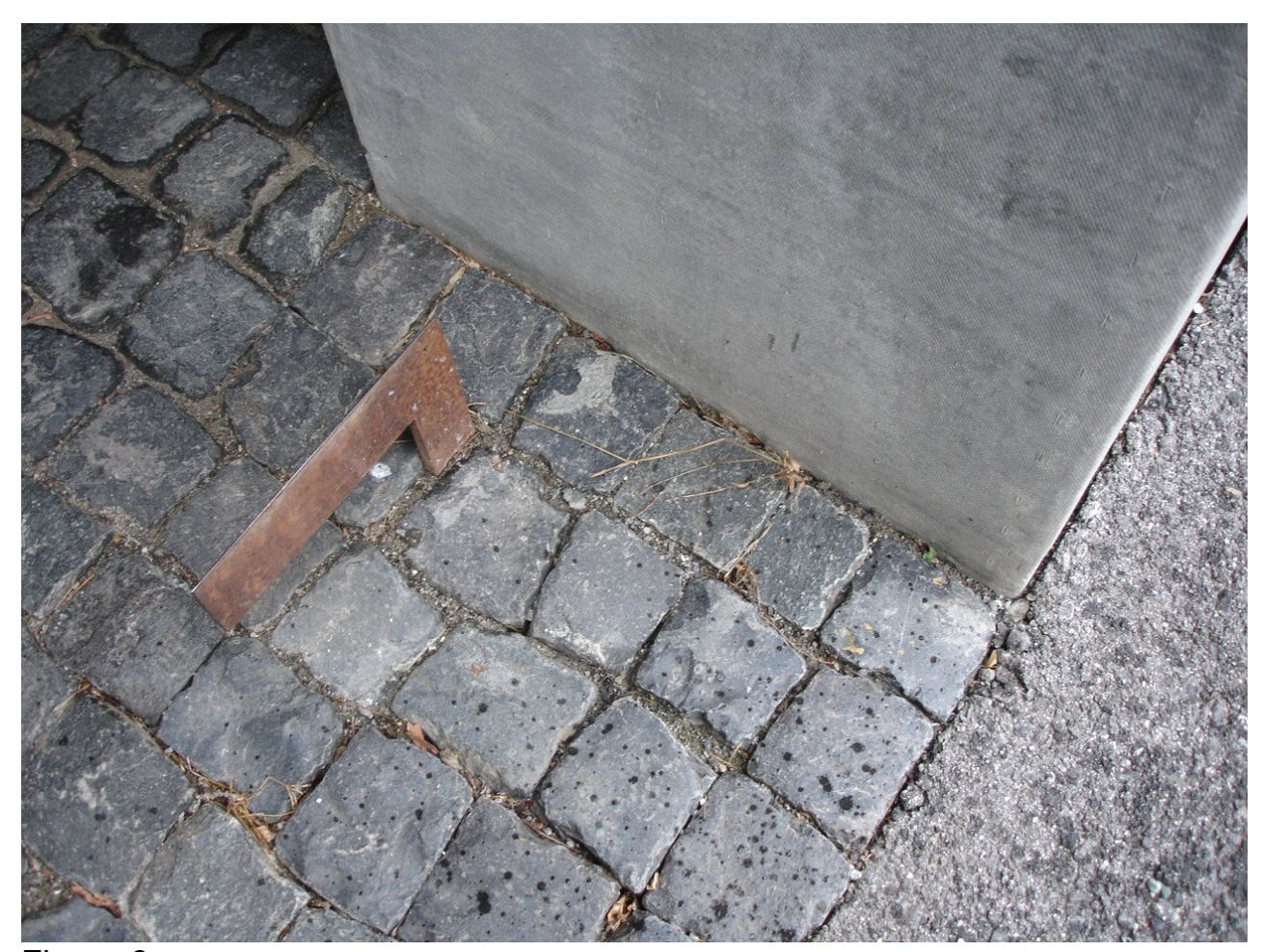
Figure 6 Consistent, beautifully-cast concrete.