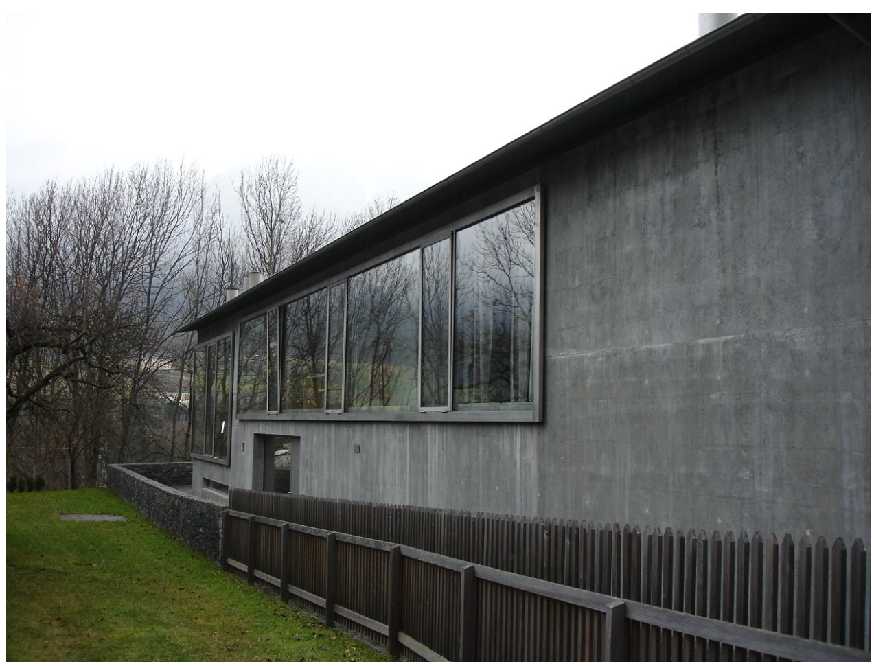
Figure 9 Window frames hang picture frame-like similar to those used in..