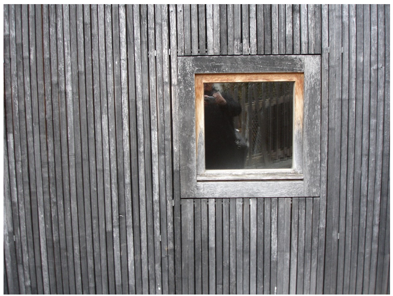
Figure 4 Narrow, weathered larch cladding.