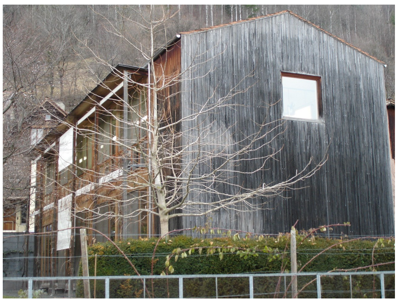
Figure 3 Barn-like form of early atelier consciously responds to local archetype.