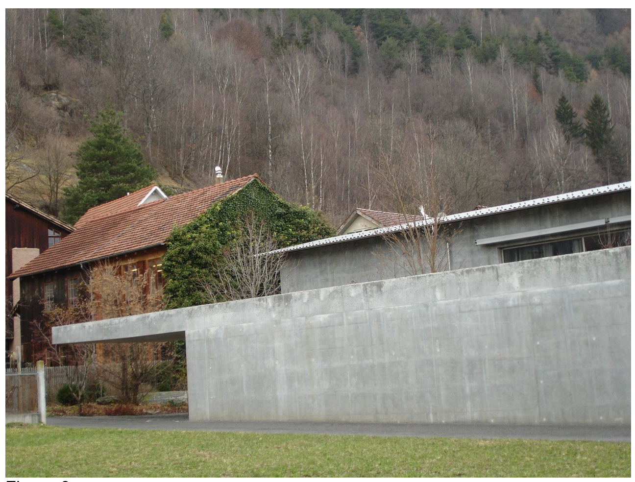
Figure 8 Defensive character of tomb-like structure.