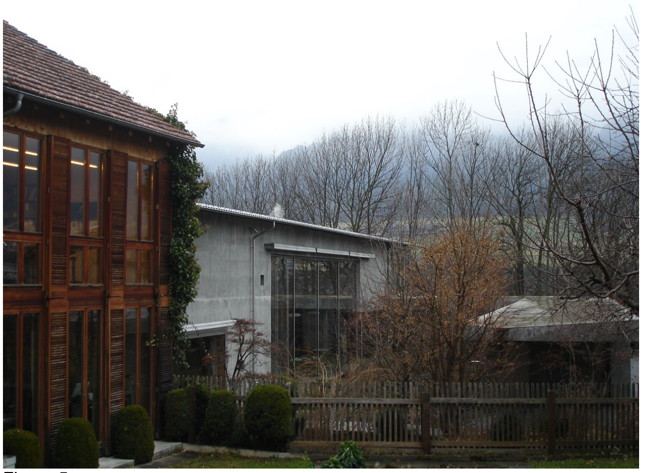
Figure 5 Simple U-shaped courtyard plan.