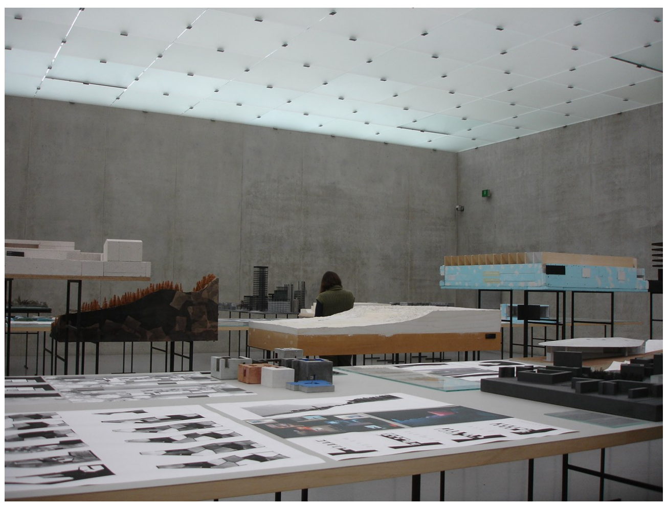
Figure 7 Initial study models for house in retrospective of Zumthor's work in the Kunsthaus, Bregenz.