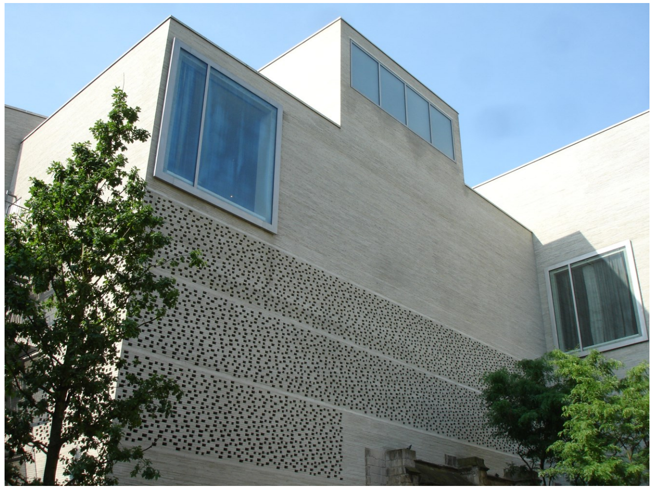
Figure 10 ...Kolumba Museum in Cologne.