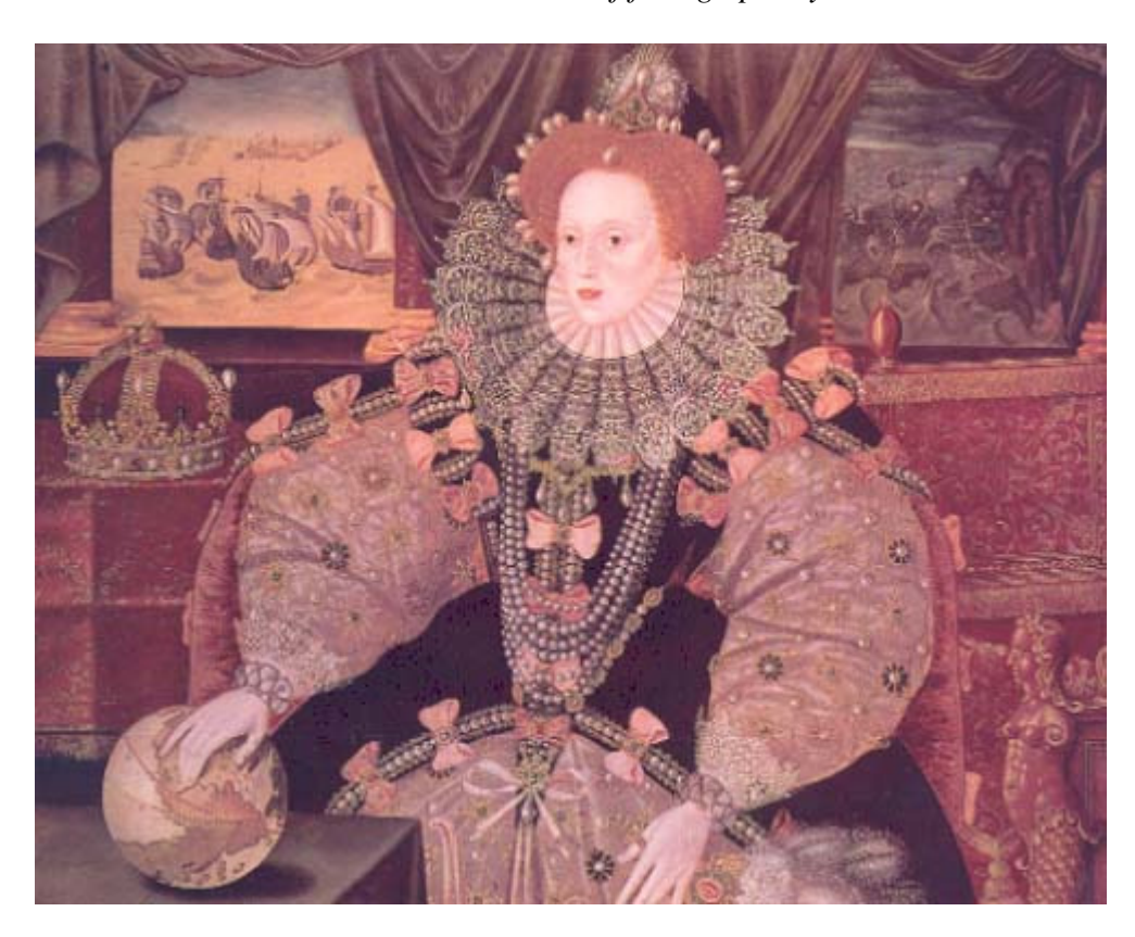
The 'Armada' portrait (c.1588) celebrates Elizabethan victory over the Spanish threat and wider imperial triumphs symbolised by the Queen's hand resting on the globe.