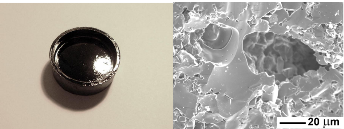
Fig 1. Carbon well (19mm diameter).