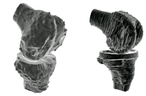
Figure 3 : Screenshot of VRML animation (a) preoperation and (b) postoperation

The 3D model of the knee joint was exported as a VRML file and an animation of the pre- and postoperative knee joint was produced (figure 3). This shows the knee joint at 70° flexion during stair descent, with a slight varus and external rotation, as shown in figure 1. This method allows for the visualization of 3D motion between the tibia and femur during everyday activities. The comparison of pre and postoperative animations will provide data that can be incorporated in preoperative planning of TKR for a wide spectrum of patient groups.