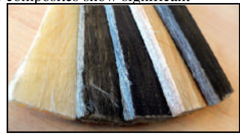
Fig. 3: From left to right, Sisal, Flax, Hemp, Abaca and Kenaf composites