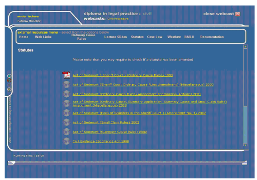
external resources menu

Webcasts are only one element of a virtual learning environment, but even from this brief position paper it will be clear that they are valuable learning tools. Like VLEs generally, they support forms of distance learning. But distance learning is exactly the wrong term for what goes on in this form of learning. Distance learning is actually intimate learning. When it goes wrong it becomes lonely learning, and when it becomes too difficult or unsupported it becomes claustrophobic learning. When distance learning goes well, it has the capacity for enormous engagement and enhancement of learning. But webcasts, like technology generally, cannot do for us what we may neglect to do for ourselves. The keys to success, in distance learning, in the use of VLEs, and in webcasting, lie in planning forms of deep embedding in the curriculum, in planning the relation between distance and intimacy, in achieving clarity of communication flows, in creating aims and expectations of task, staff and students, course, curriculum, institution — in other words, when webcasting becomes, invisibly, part of the contours of learning within the virtual learning environment.