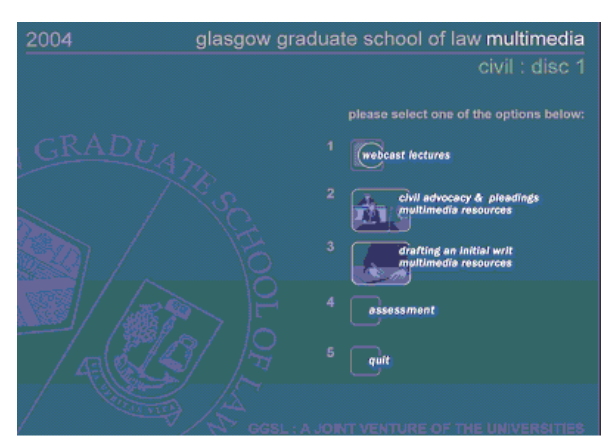
the startup menu

Entering the civil procedure webcast environment students are presented with a menu which include the lectures, a multimedia unit on advocacy and pleading, a multimedia unit on drafting writs and an assessment unit: