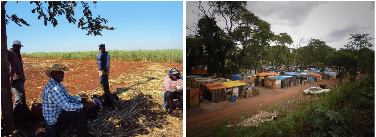
Figure 3 and 4. Rural workers supplying cane to Raizen Maracaí and a camp with former and current rural workers near Araraquara, São Paulo

and others, the Federation's energies are also spent amongst landless occupations and settlements that it helps to organise. By straddling the swaying sugar cane fields of the ethanol supply chain (Figure 3) and the encampments/settlements of low- and semi-skilled, current and former cane harvesters and transporters (Figure 4), it articulates a vision for farm scale, integrated food and energy innovation that departs from an often disappointing return to familial agriculture, embraces new bioenergy and biofertiliser technologies and is gaining some traction with local media and researchers from locales affected by agroindustry.