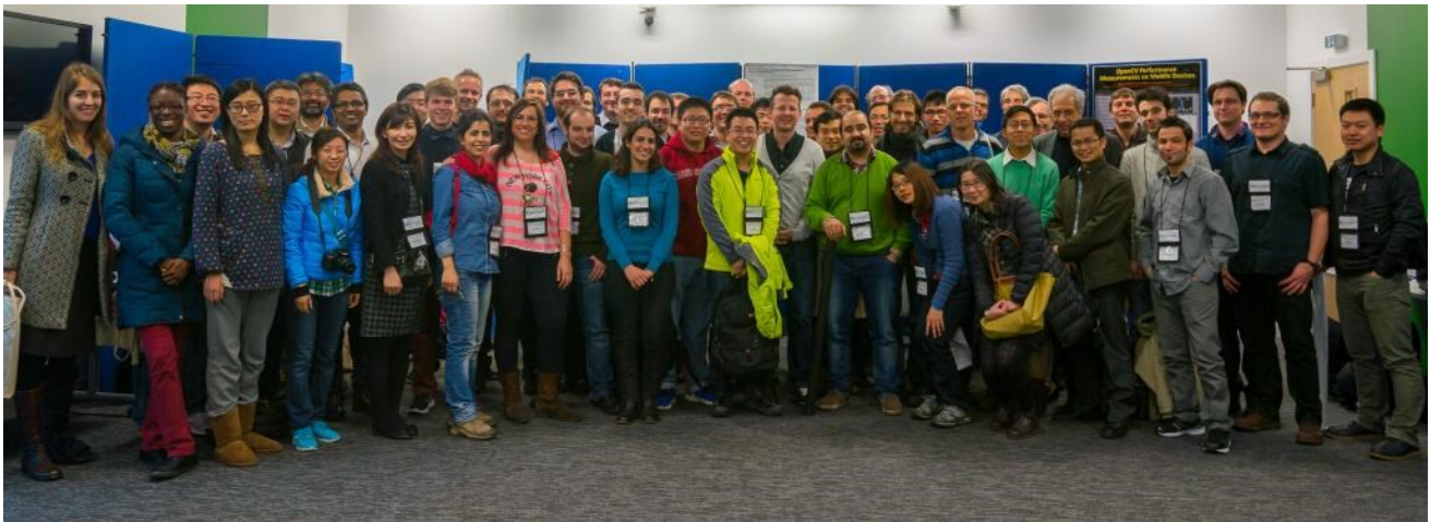
Figure 4: Poster and demonstration session from the last day of the conference

From the main technical program 4 papers were selected to be considered for the best paper award and these were presented in a best paper session. The nominated papers were: