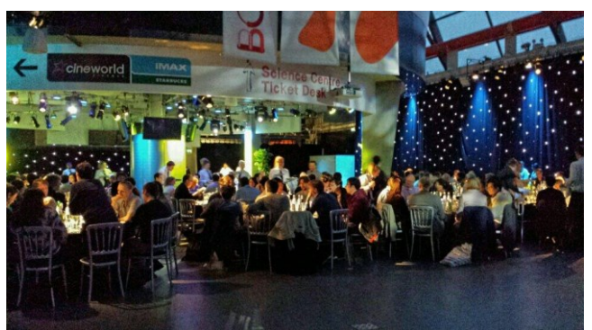
Figure 2: Conference dinner at Glasgow Science Centre