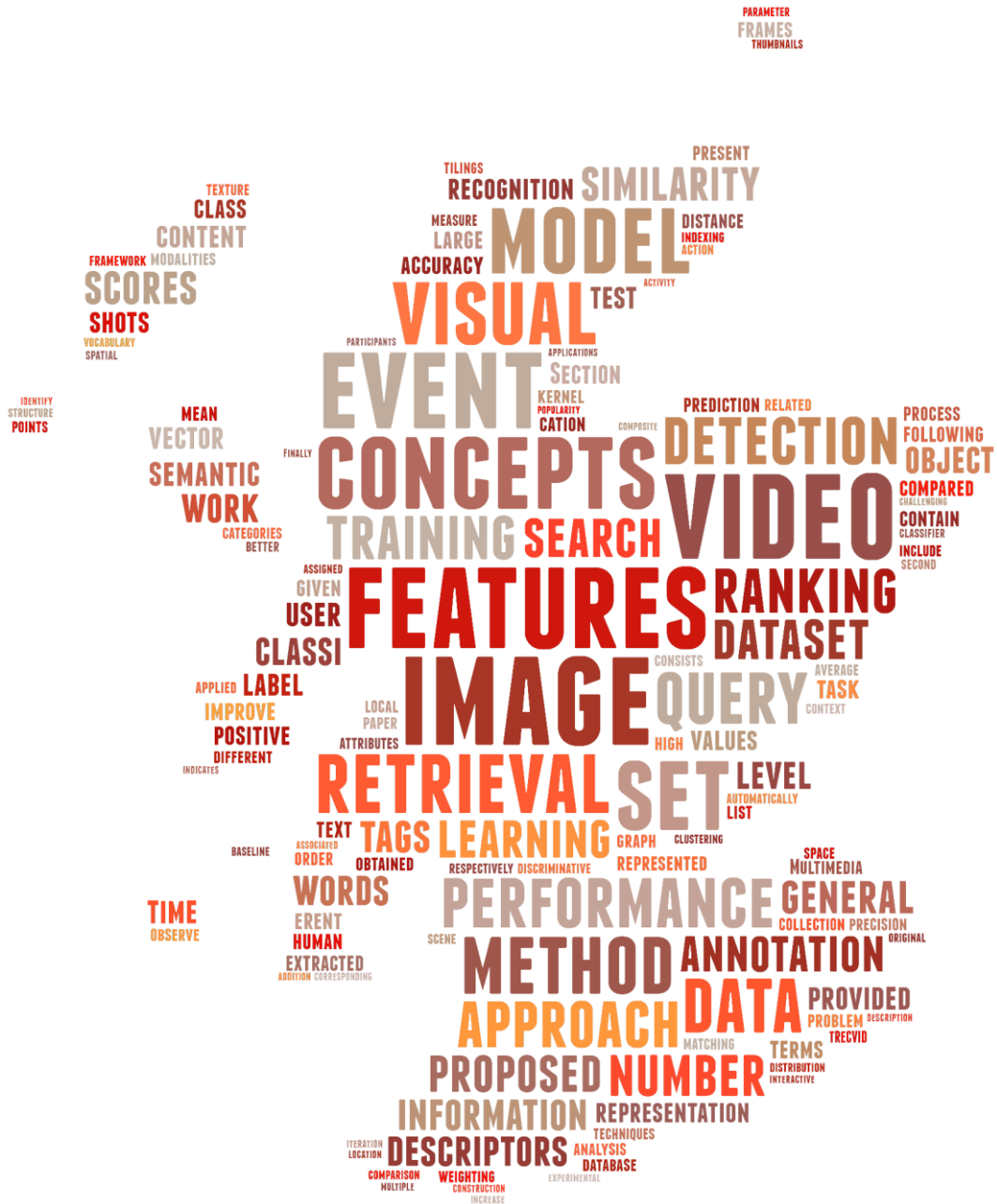
Figure 3: Main topics from ICMR 2014 papers, keywords are taken from the abstracts of accepted papers

In terms of numbers, we received 111 valid submissions for the full regular research papers of which 21 were accepted for oral presentation (18.9% acceptance rate) and 21 were accepted for poster presentation (giving an overall acceptance of 42 papers with 37.8% acceptance rate). For short papers, we received 56 submissions, of which 27 were accepted for poster presentation (48.2% acceptance rate). We also had two special sessions Harvesting and Analyzing Live Social Media Data (5 papers accepted out of 10 submissions) and User-centric Video Search and Hyperlinking (3 papers accepted out of 9 submissions). The submissions to the special sessions were organised separately by the special organisers and are not included in the other submission figures above. Further, we had 13 technical demonstrations of systems showcasing key research contributions. The demonstrations and poster presentations were split across two dedicated sessions, these sessions were also accompanied by a wine and cheese reception to help make the event more social (see Figure 4).