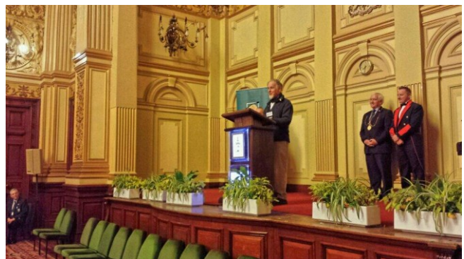
Figure 1: Welcome reception at Glasgow City Chambers