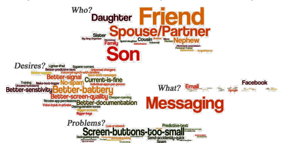
Fig 2: Tag clouds of postcard responses

We explored some of the themes that had emerged from the initial workshops in an