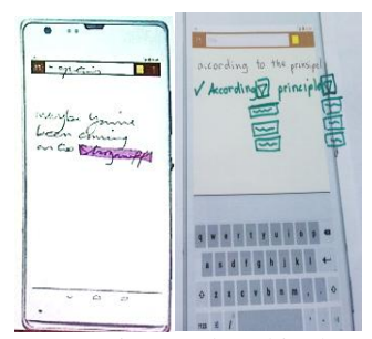
Fig 3: Designs for error correction produced in the prototyping exercise

Paper Prototyping: We brought the three groups from the earlier blooper sessions together for a paper prototyping exercise on blooper support. As in previous sessions we made tag-clouds from the data and presented these at the start of the session. In groups of 4, pre-selected by us to reflect a diversity of phone ownership and experience we asked participants to take part in a warm up activity to familiarise them with the method and to get to know others in the group. We asked them to design an interface for a meal-sharing app then to present their ideas. Designs were to be drawn on paper facsimiles of mobile phone interfaces with blank spaces for participants to make drawings and annotations. They did this without the need for further instruction from us. We moved on to using the same method to design for ideal error correction. We reminded them of the concept of bloopers outlined in the earlier session and each group was allocated 2 tasks out of a possible 4. Task 1 is given as an example of the type here: These suggestions are good, but imagine they were not. How could this be adapted to allow it to make alternative suggestions and allow you to pick them? Sketch your ideas. Each group worked on their tasks then presented their ideas to the rest of those assembled. A design resulted for every task (e.g. Fig.3).