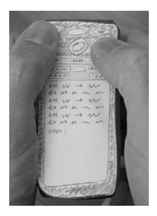
Figure 3: paper prototype of ideal 5-key text phone

Figure 4 shows the current J2ME prototype implementation as used in user experiments discussed later. This prototype uses only the top part of a nine-key traditional phone pad with quarter of the alphabet allocated to each of buttons 1, 4, 3 and 6 with 2 acting as combined space/next key. Figure 4 shows the prototype interface for a user entering the phrase "hello how are you" – note the lower-right (6) button on the key-guide showing that only u is valid as the next letter on that key.