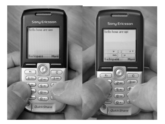
Figure 5: five-key and nine-key prototypes as used in user study

Using a GPRS data connection, key-strokes were recorded each time the space key was pressed. These records were time stamped in tenths of a second and recorded the display status at that point.