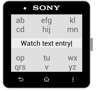
Figure 1: Prototype smartwatch text entry on Sony SmartWatch 2

Permission to make digital or hard copies of part or all of this work for personal or classroom use is granted without fee provided that copies are not made or distributed for profit or commercial advantage and that copies bear this notice and the full citation on the first page. Copyrights for third-party components of this work must be honored. For all other uses, contact the Owner/Author. Copyright is held by the owner/author(s). CHI 2014, Apr 26 - May 01 2014, Toronto, ON, Canada ACM 978-1-4503-2474-8/14/04. http://dx.doi.org/10.1145/2559206.2581319