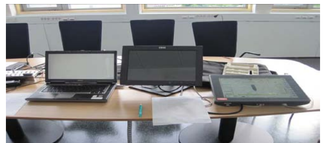
feedback from the test participants after finishing the Figure 6: Static Lab Environment

user study and going through a post-task walkthrough led to the development of the second generation prototype which will be described in section 6.