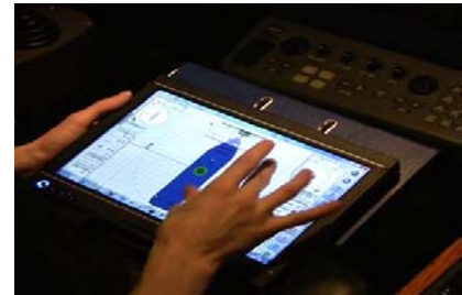
Figure 5: 2nd Gen Prototype

ranked officers, between the vessel and the oilrigs and also between the vessel and shore base.