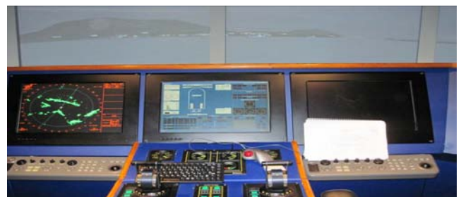
Figure 7: Moving environment using HSC simulator

The fourth and last iteration of user studies was carried out also using the 2 nd generation prototype, but with the Rolls-Royce DP system running on the tablet computer. The aim of this experiment was to investigate the differences between using gestures or touch in a static environment versus a moving environment. This iteration used the authentic DP