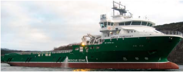
Figure 1: PSV Havila Foresight

traditional input techniques. One of the initial studies of two-handed input was presented by Buxton and Myers [Buxton and Myers, 1986]. They concluded that the two-handed method tested outperformed the one-handed technique, which was most commonly used in 1986 at the time (and still is today). What appears interesting is the fact that poor design can make interaction with two hands worse than with one [Kabbash et al., 1994]. It is unclear whether occlusion and reaching over the tabletop can counteract the benefits of such interaction [Forelines et al., 2007]. This will increase the need of well- designed GUI's especially in a maritime environment where safety is of utter importance.