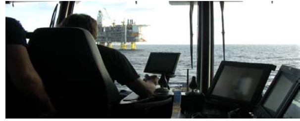
Figure 2: DP Operation onboard PSV

To observe and report are techniques widely used for both social research and usability related research. In social research the observation is often part of an ethnographic study where the researcher immerses him/herself in the environment observed for months or even years [Bryman, 2008]. For usability studies and gathering knowledge around processes connected to carrying out specific tasks, smaller studies combined with interviews of users are more beneficial and commonly used. As mentioned earlier, "knowing the user" is important, but it is often difficult for users to express their views and put these in the context of wider HMI work. The benefit of being an outsider observing the users is that the observer might question issues that the user may never have thought about. This gives a wider angle to finding the