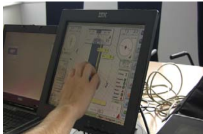
Figure 4: 1st Gen Prototype