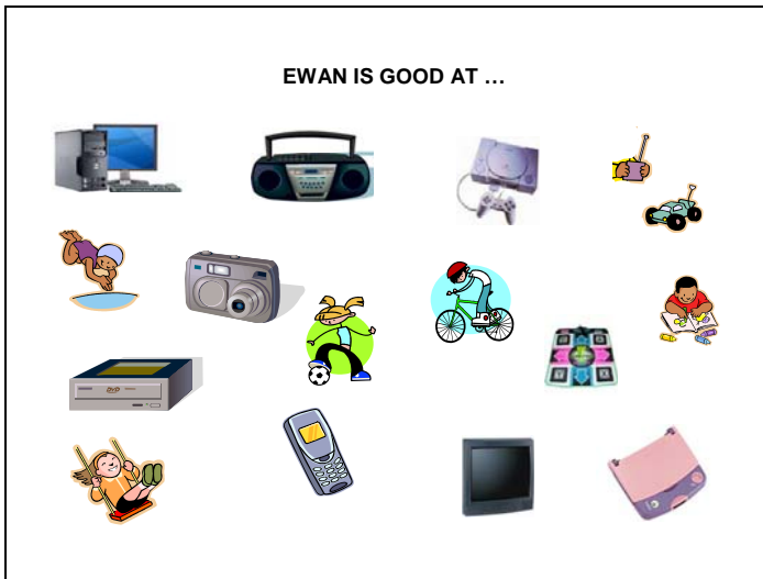
Figure 2 Examples of materials used in activities in round 5

how to use some technologies and (iii) sorting a range of technological and non-technological activities into those which made them happy and those which did not. The nature of these tasks is described in more detail below. (All names used are pseudonyms.)