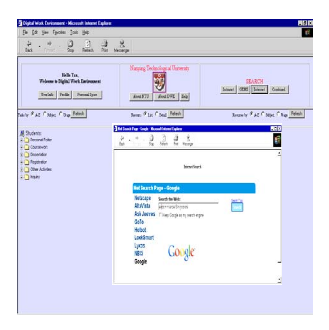
Figure 6: Internet Search Form

DWE adopts the concept of the NetScape Net Search Page to support the searching of Internet resources as shown in Figure 6. Users can choose any of the nine search engines, namely, Netscape, AltaVista, AskJeeves, GoTo, Hotbot, LookSmart, Lycos, NBCi and Google to carry out the search using simple keyword search. The selected search engine remains as the default search engine in subsequent search sessions. This default search engine information is captured by DWE automatically and stored as part of the user profile information. The majority of users are expected to use the simple search features as opposed to the advanced search features.