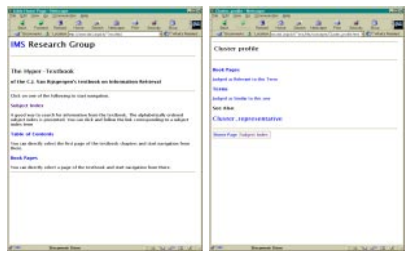
Figure 1. a) Home page of the hyper-textbook. b) Page of a term of the subject index.