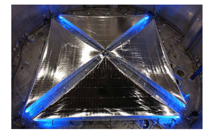
Fig. 4 Completed deployment test of a 20 \times 20 m solar sail to assess the use of storable booms and thin film reflectors (NASA)

The use of occulting discs for geoengineering has been discussed in some detail in sections 3 and 4, with a mass of order 5 \times 10^7 tonne required to offset a doubling of atmospheric carbon dioxide. Clearly, the fabrication of a swarm of occulting discs with a mass of order 10^7 tonne would require a capability to exploit in-situ resources such as near-Earth asteroids (although Angel envisages terrestrial fabrication of thin film refracting discs, and hence launch to L_1 [24]). For example, the mass requirements for the minimum mass occulting disc (or discs) can be satisfied by small M-type asteroids, which are abundant in nickel–iron materials and carbon [32]. A range of