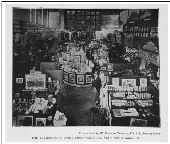
Figure 1. A view of the Livingstone Exhibition from the Gallery.

life-like tropical scene, peering inside a tent to find a bed and bedding, mosquito net and articles of tropical clothing. The man who had assembled it, Mr. Joseph Tucker, could 'provide everything a missionary can require' noted Battersby [4]. There was also considerable space devoted to foodstuffs suitable for tropical travel, notably fresh vegetables, which were frequently in short supply in tropical climates. Merchants touting 'desiccated' vegetables stressed the light-weight and compact nature of their dried and sealed produce. Battersby wondered whether they were 'in all cases palatable', though was convinced that from the 'point of view of health there can be little question of their superiority' [4]. Bovril Limited and the Portable Food Company displayed rations, while the Anglo-Swiss Milk Company, Frame Food and Allenbury's Food presented what were considered appropriate foodstuffs for children.