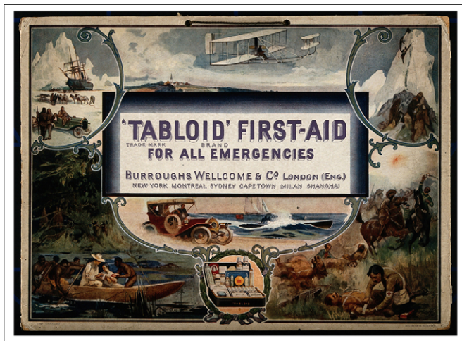
Figure 3. An advertisement for Burroughs Wellcome's Tabloid medicine chest, showing various situations in which it could prove useful.

Tropics. The worst menace he has to face is disease', the company noted in one of its publications. The tropical colonies, they went on, 'are by far the most dangerous regions for travellers', where 'desolating ailments' are encountered, all of which 'are particularly fatal to the so-called white man who originates in temperate climates' [11]. BWC played on widespread fear of the diseased and deadly tropics to sell their chests, offering reassurance to middle-class white Europeans that the Tabloid chest would make them both safe and superior in Britain's tropical possessions. These chests, claimed BWC, went 'hand in hand with the advance of civilisation, the conquest against disease and the battle against ignorance and superstition' [12].