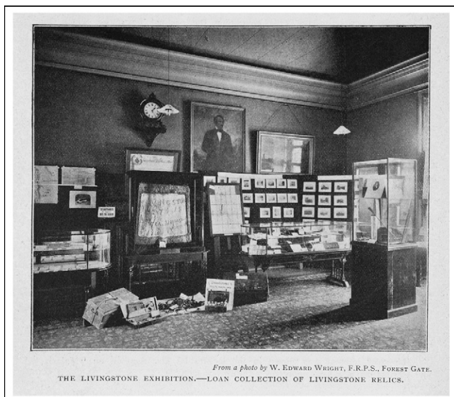
Figure 2. A display of David Livingstone's 'relics' at the Livingstone Exhibition. Reproduced from Climate 1(4), 1900, p. 136.

There were displays dedicated to medicine. For example, scientific instrument maker Mr. James J. Hicks