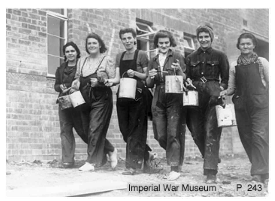
Figure 4 Six women painters at work on a Ministry of Supply site (location not known), where houses were being built for arms workers.

More recently, women have been taking trade courses at colleges of further education, often as council apprentices, and a few are starting to be seen working as employees of building companies or on their own account, as sole traders. The most famous painting job in Scotland, the famous Forth Rail Bridge, has only ever had one woman working on it as a painter: Lisa Pringle (Hay).