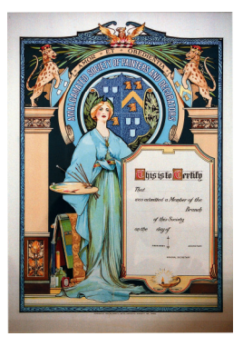
Figure 2: Membership scroll from the Amalgamated Society of Painters and Decorators.

At first glance, it would be easy to say that women are not housepainters in the UK. They are not to be widely found advertising, particularly outwith the south east of England, and you do not see media images of them at work. However, from earliest times, a woman has represented the occupation of painting, at least in its iconography (Figure 1, Orgal (1979)). When the modern trades unions were creating their banners, it would still have been unimaginable that women could join and be equal with men in the trade, yet the Amalgamated Society of Painters and Decorators' banner (Figure 2) prominently shows a figure of a woman painter, holding an artists' palette and with the equipment of a house decorator at her feet. She wears the blue robe that signifies purity and innocence and the society's motto translates as "Love and obedience" which surely must have represented the qualities expected of the dutiful housewife more accurately than those of the common house painter. Perhaps they meant to instill a love of work and obedience to the client's wishes in their members.