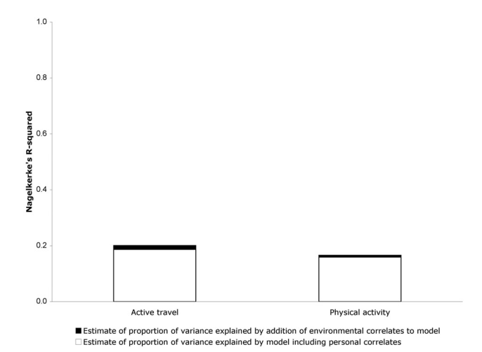
Figure 3 Estimated proportions of variance in active travel and physical activity explained by personal and environmental characteristics.

and car-owning households than predicted from 2001 census data for the same census output areas, these differences may be partly accounted for by an upward background trend in owner occupation and car access between